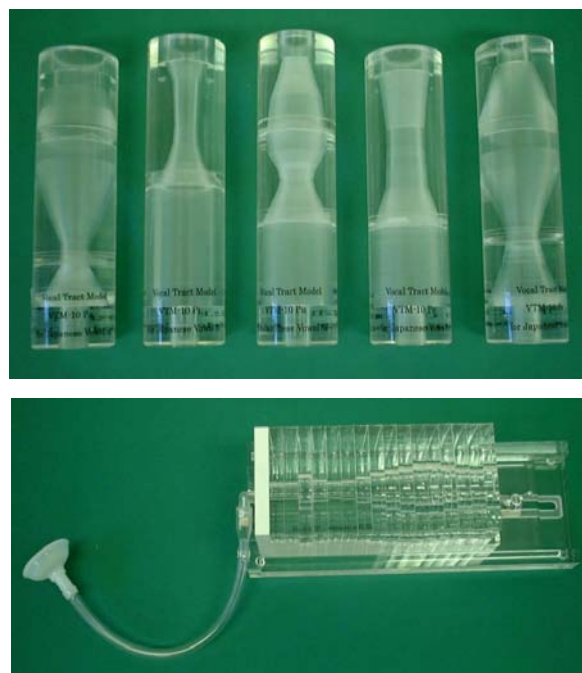
Figure 2: Arai's model of the human vocal tract (top: cylinder model; bottom: plate model with a whistle-type artificial larynx). They are available through NTT Advanced Technology Co. Please see the following URL for more information:

Fig. 2 shows two types of physical models of the human vocal tract: the cylinder model (on the top) and the plate model (on the bottom). The two models are made of acrylic resin because it is both transparent and easy to sculpt. For the cylinder model, the cavity forms a round bottle-shape, based on the measurements by Chiba and Kajiyama [17]. For the plate model, each plate has a hole in the center so that when placed side-by-side the holes form an acoustic tube, the cross-sectional area of which changes in a step-wise fashion. When a sound source is connected to one end of either of the models, a vowel-like sound is emitted from the other end. We typically use an electrolarynx and a whistle-type artificial larynx (as shown in Fig. 2) for sound sources.