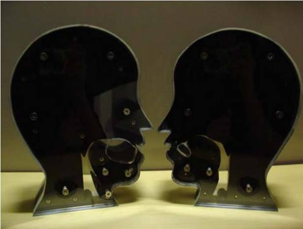
Figure 3: New physical models for consonants /r/ (right) and /l/ (left).

in his/her language, the models might be useful for the same reasons. Figure 3 shows a newly developed models for consonants /r/ and /l/ (designs are based on Stevens, 1998 [22]). Besides this model, we have developed models for stridents, nasalized vowels [6], etc.