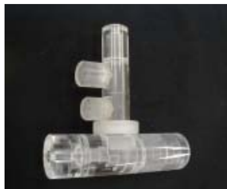
Figure 1: Model of the human vocal tract for nasalised vowel /a/.

[12] Stevens, N. K., Acoustic Phonetics , The MIT Press, Cambridge, 1998.