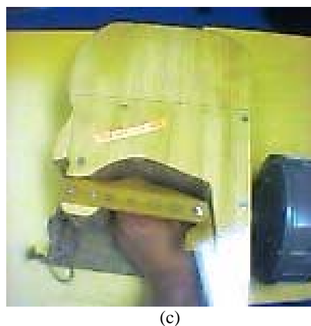
Figure 2: New physical models of the human vocal tract.